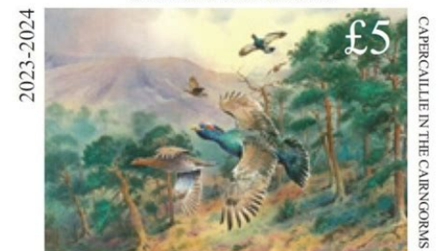
BASC WILDLIFE FUND